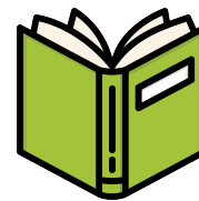
Depth of Knowledge