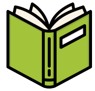
Depth of Knowledge